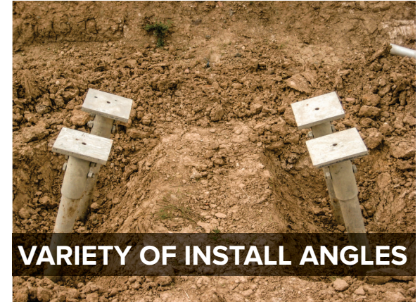
VARIETY OF INSTALL ANGLES

Very low mobilization and demobilization costs. Look at the real costs of installing alternates and you might be as surprised as we were when we did the math.