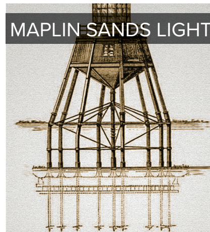
MAPLIN SANDS LIGHT

Alexander Mitchell's helical screw pile design is just as effective today as it was in the late 18th century and continues to be installed around the world.