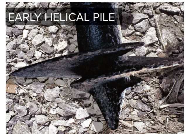
EARLY HELICAL PILE